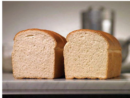
No visible difference: (left) baked with conventional wheat flour, (right) baked with Ardent Mills Safeguard™ treated wheat flour.

Our team of experts will work with you to understand your product needs and potential risks, then recommend the right answers to help you grow your brand and boost confidence. With our comprehensive capabilities and resources, Ardent Mills is ready to be your food safety ally.